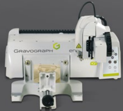
M40 Deep vice