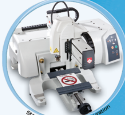
Standard engraving configuration for one-off jobs