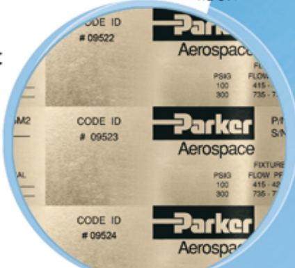
Multiple plate production in a single operation