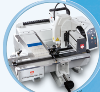
Simply slot APF in vice for high-volume engraving