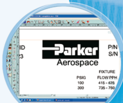
Exclusive software functionalities to optimise engraving productivity