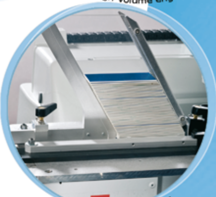
Able to hold over 312 plates